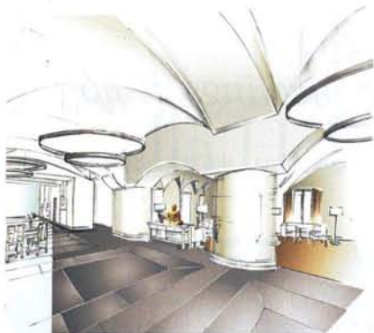
A rendering of Schloss Velden's lobby

be in County Cork, Ireland, where Capella Castlemartyr will open in spring 2007.