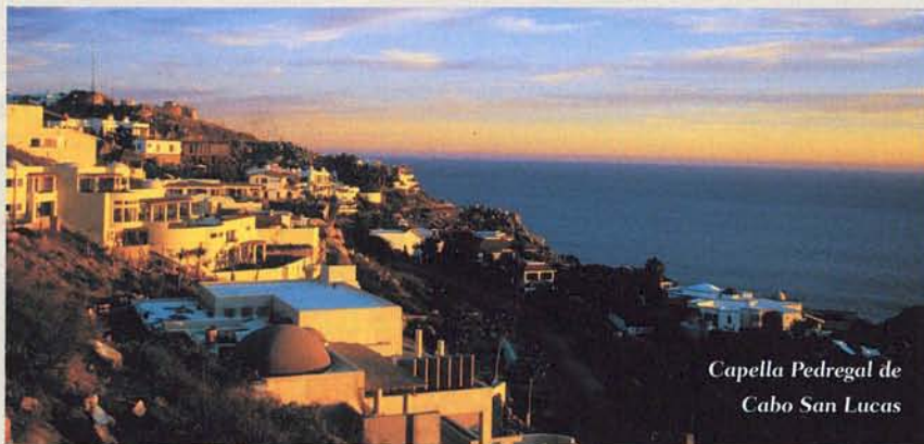
Capella Pedregal de Cabo San Lucas

CAPELLA CASTLEMARTYR is the first of five properties that Capella Hotels & Resorts plans to open in the next 18 months. The remaining four—Schloss Velden, Dunboy Castle, Breidenbacher Hof, and Capella Pedregal de Cabo San Lucas—will be followed by additional projects in Asia, Europe, and North America.