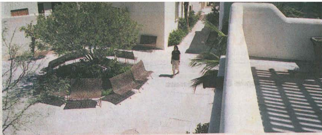
NATIVE LOOK: Walkways leading to small plazas crisscross an adobe-style village in Loreto Bay.

Swept up in the sustainable-development theme, it would be easy enough to ignore the homes