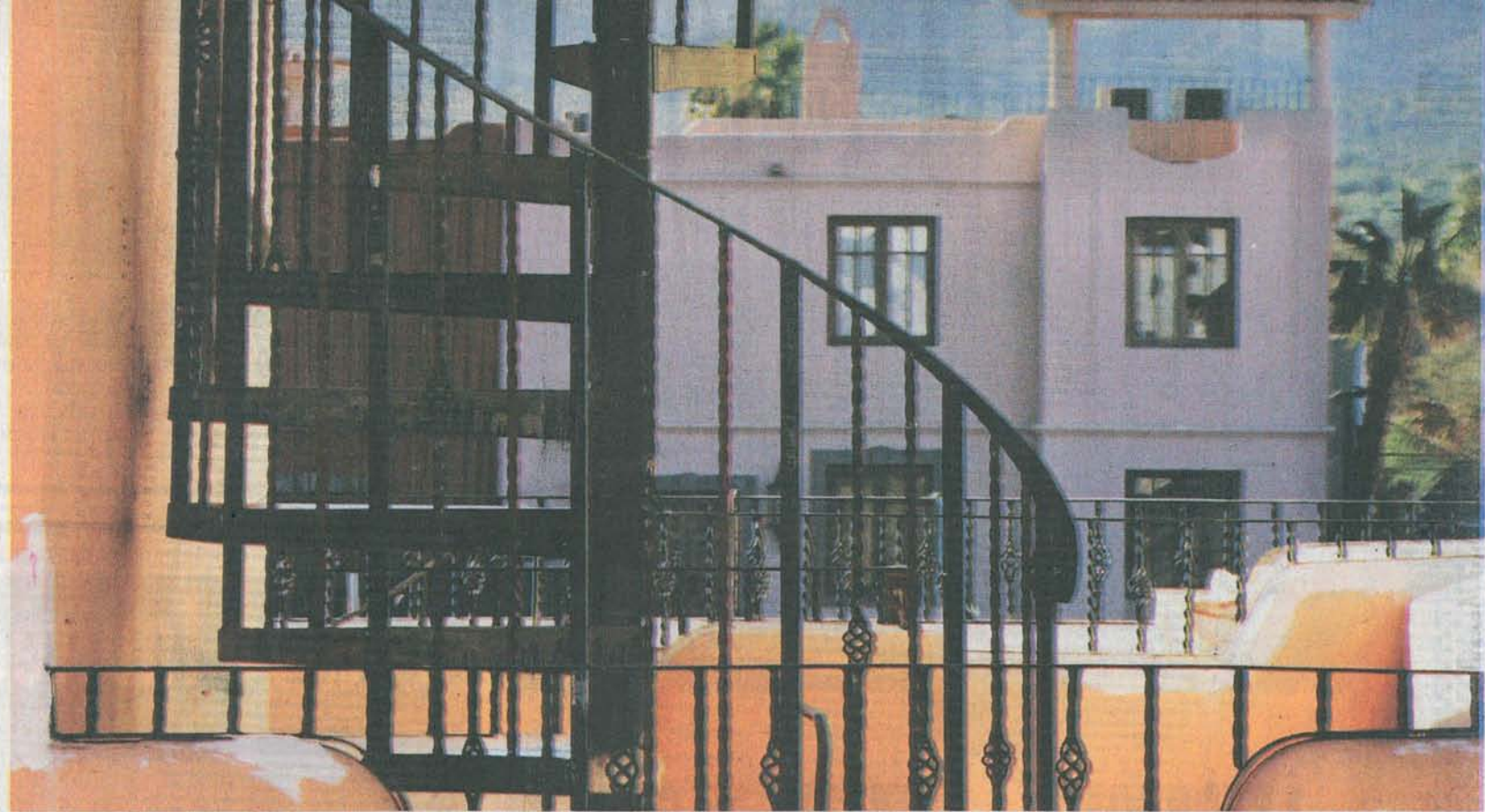
DON BARTLETTI Los Angeles Times

OFF THE GROUND: Prices for homes in Baja's Loreto Bay start in the high $300,000s. The area, long targeted for development, is gaining momentum.